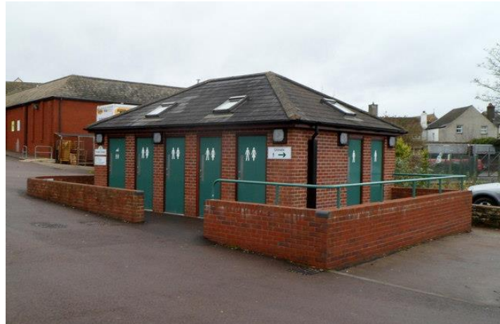
Figure 10 Public Washroom Coleford, UK.

Public washrooms are sometimes used for activities other than their intended use. They can be a source of shelter for people who are sleeping rough (Neale and Stevenson, 2013), and a shortage of public washrooms in certain areas can make homelessness all the more difficult (Daiski et al. 2012). Public washrooms are also the site of various “backstage behaviors” (Cahill et al. 1985), that can sometimes include graffiti, drugs, intimacy, and other unsanctioned uses (Schapper 2012). For example, much of the foundational social science work on washrooms responded to wider moral panic over men having sex with men in public washroom (Desroches 1990; Humphries 1970; Nardi 1996; Warwick 1973). More recently, advocates and activists for accessibility and inclusion argue that public concern over unsanctioned behaviours or uses should not be the focus of policy and planning; instead, the focus should be to prioritize the provision of safe and accessible washrooms.