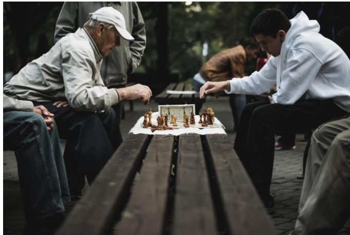
Figure 3 Public Chess Game.

Libraries are spaces that are “trusted, safe and constructive,” allowing people of all ages to make connections (Johnson 2012: 61). Libraries and community centres provide opportunities for non-familial intergenerational contacts (Lee, Jarrott, and Juckett 2020). They offer two main types of intergenerational contact: (1) improvised, and (2) programmatic. In the first, improvised