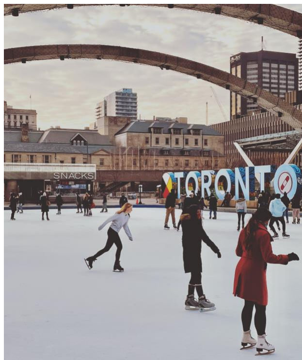
Figure 6 Nathan Phillips Square, Toronto.

The public realm panels explored the social and physical elements of the public realm that facilitate sociable encounters. Participants discussed how sociability is cultivated in different spaces, from sidewalks and parks to public leisure and festival spaces. Throughout this report we emphasize the importance of various kinds of public spaces as essential parts of our social infrastructure. The place of service-based and programmed spaces like libraries and community centres in providing social infrastructure is more immediately evident. In this section, we consider the place of ordinary free and accessible public spaces, from parks to outdoor ice rinks, from sidewalks to parkettes, as essential parts of social infrastructure. Many such spaces are generally so integrated into the round of everyday life in built-up areas that we may take them for granted. Some may even think it somewhat frivolous to take them seriously as something more than simply functional spaces. Social scientists, and especially sociologists of