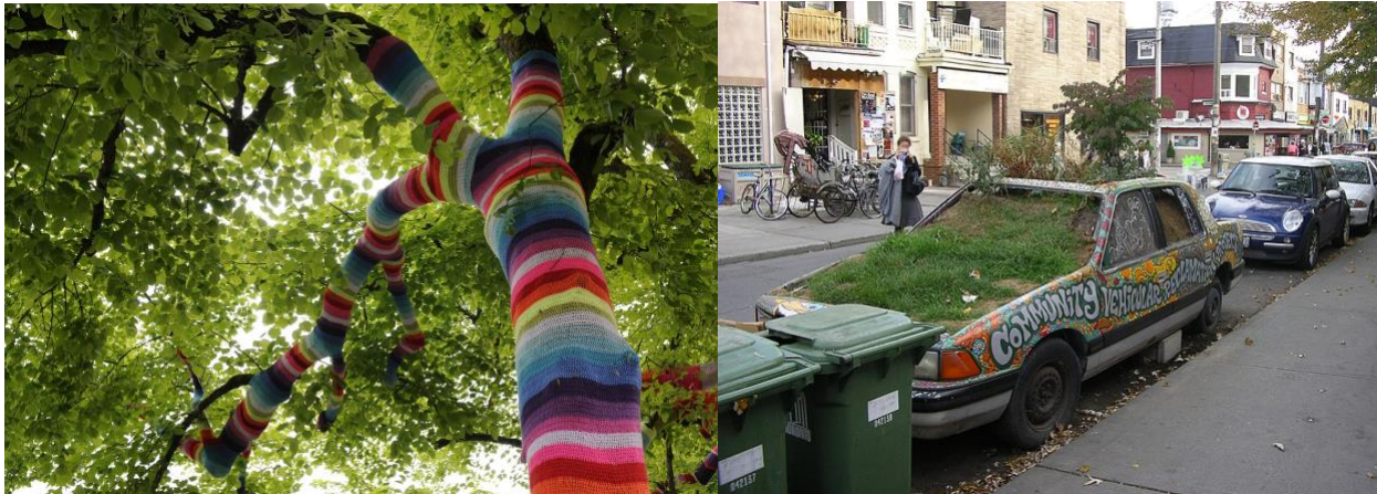
Figures 10 & 11 Yarn Bomb Tree & Car Garden, Kensington Market, Toronto

Related to the above art and cultural activities is the rise of DIY, guerrilla, activist, and other grassroots urban tactics that centre on urban change, community, and placemaking (Hou 2010; Webb 2018). Known under a number of different terms (tactical urbanism, insurgent urbanism, grassroots urbanism), these DIY urban strategies have been termed, “civic-minded and intended toward the functional improvement of lived urban spaces through skillful, playful, and localized actions” (Douglas 2014, 6). For example, urban intervention practices such as guerrilla gardening (planting gardens in underused urban spaces, regardless of land ownership) or yarn bombing (knitted/crocheted street art in unexpected places) have aesthetic and social components. As one yarn bomber describes, “it causes people to stop and talk, and to communicate with one another. You wouldn’t normally chat to someone in the street, but it causes a person to stop and