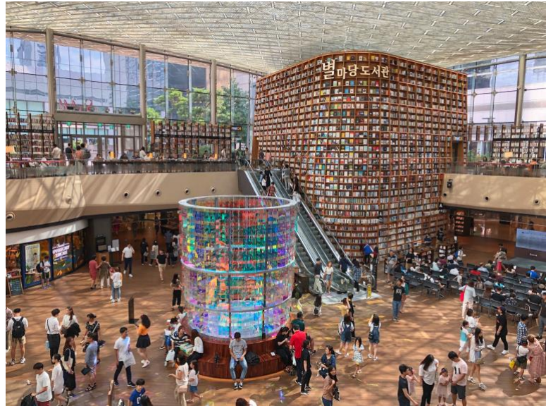
Figure 5 Starfield COEX Mall, Seoul.

A shopping mall is more than a site for the consumption of goods. Malls present key spaces of sociability, and this does not necessarily involved shopping. Some researchers adopt a relational lens to approach mall sociability; this sort of framework emphasizes that goods are communicative, consumption is a social practice, and malls are spaces that shape and reconstitute people's relationships (Miller et al. 1998; see also of Bourdieu 2002 and Douglas and Isherwood 1996). From such a perspective, malls