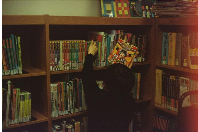
Figure 2 Child at a library.

Libraries often segregate space according to users, reserving certain spaces for children, teenagers, and seniors (Aptekar 2019b; Iveson and Fincher 2011). They are also regularly