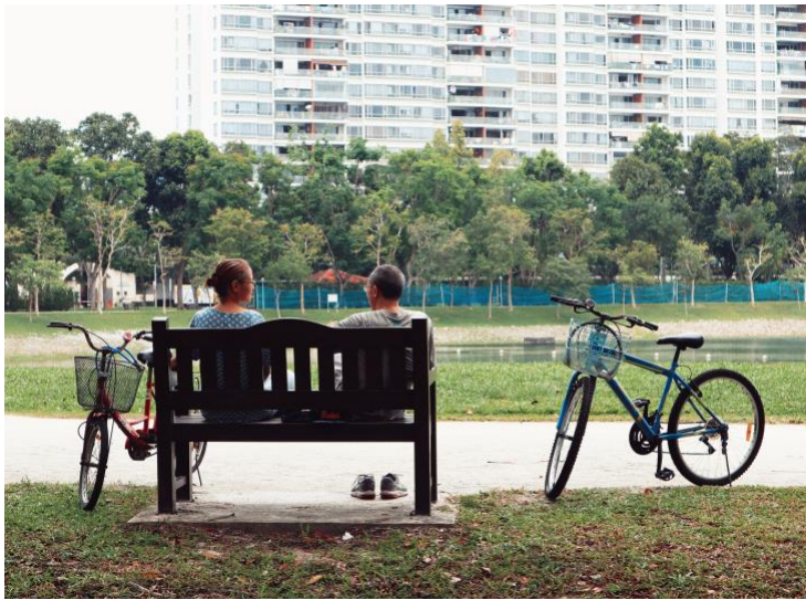
Figure 11 People resting on a bench.

As physical artifacts, benches provide particular “affordances of sociability” (Horgan et al 2020): they are an “open gesture of welcome, an invitation to linger” (Bynon & Rishbeth 2015). The bench is a simple element in the design of public space, but one that fulfils important social functions as it “facilitates a mix of activities, comfortable for longer-stay users and accommodating a flow for those ‘just pausing’” and in so doing “can provide a broadly inclusive place within an urban locality. Choice of where to sit is important in supporting a personal agency, easing the mostly unspoken practicalities and challenges of proximity to unknown others” (Rishbeth and Rogaly 2018).