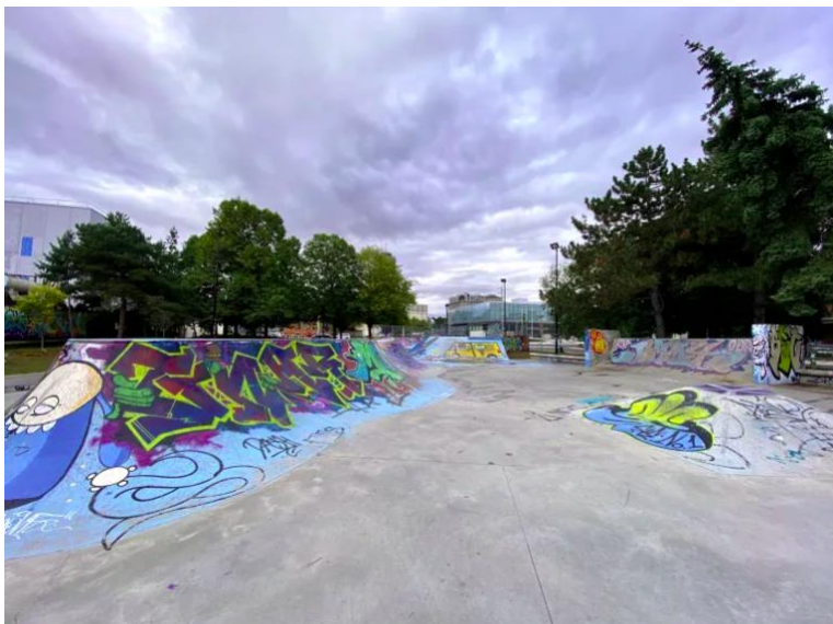
Figure 7 Beasley Skatepark, Hamilton.

Some, but not all, public spaces are characterized by mutual suspicion, wariness, or fear. Based on decades-long research in the US, Anderson observes that “racially mixed urban space . . . exists as a diverse island of civility located in a virtual sea of racial segregation” (2015, 11). The best kinds of spaces of generally unencumbered interracial interaction are characterized by sociability,