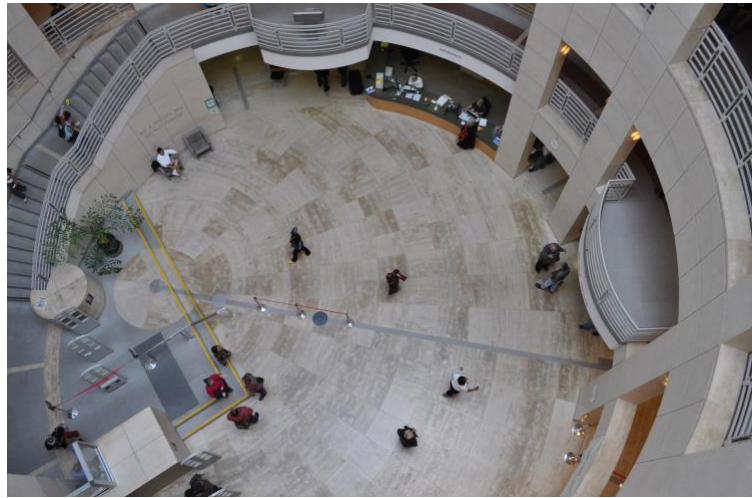
Figure 4 San Francisco Public Library.

Community centres, along with other community spaces, such as community gardens and farmers' markets, can be both sites of community belonging and where power inequalities emerge (Aptekar 2015; Gallant and Hutchinson 2016). Social hierarchies and circumstances of gentrification can lead to resistance and conflict between members. Different types of community centre models impact accessibility for community members. Centres that follow a consumer-focused model, for example, will be more corporate and potentially present a financial barrier to membership and access (Gallant and Hutchinson 2016; Glover 2004). Depending on the structure of a community centre and its program, memberships and fees make these spaces less accessible to individuals who are low-income or experiencing homelessness. Conflict can arise between long-term residents and newcomers in centres where community members have decision-making power.