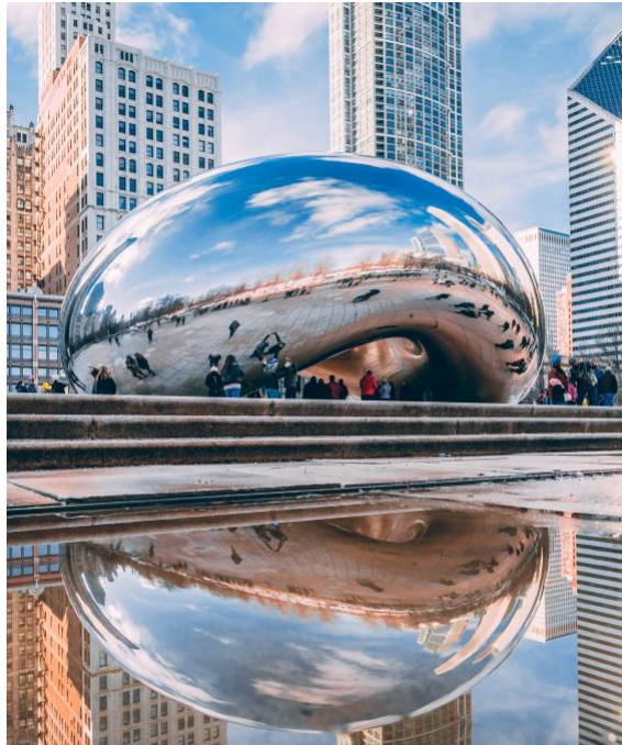
Figure 8 Chicago Bean.

In this regard, recent examples involving the taking down of statues together with other ways of contesting official historical monuments are worth mentioning here. The actions are also a form of public gathering that produce connections rooted in politics and activism, and they augment public discourse on political and social justice issues (Cox 2021). The wider literature on public art, history, and collective memory emphasizes the importance of allowing space for marginalized histories to be told and for dialogue, even if tense, to take place. To address potential conflicts and exclusion within public art projects and over their characterizations of culture and history, Zitcer and Almanzar (2020) have developed an evaluative rubric for planners and the public to use in decision-making processes for cultural representation in public spaces, and it addresses the process of selecting, funding, siting, and maintaining artworks.