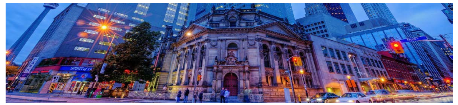
Draft - v.2